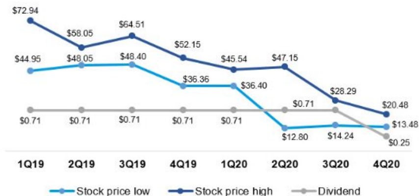
Stock Price Range and Dividends

We have paid quarterly cash dividends on our common stock during the past two fiscal years. Payment of future dividends will depend on earnings and other factors.